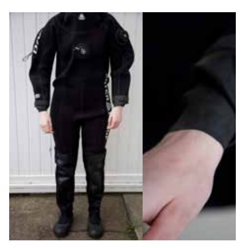
Layer 3: Drysuit

Material: Neoprene Manufacturer: Waterproof or O´Three