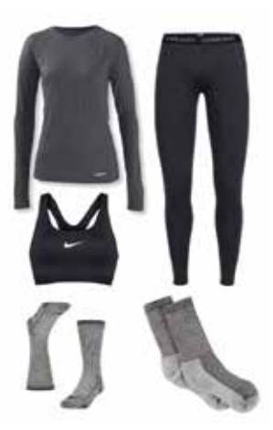
Layer 1: Base Layer

Thin thermals in wool, fleece, or synthetic.Warm socks in wool, fleece, or neoprene.(Cotton not recommended)